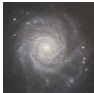
spiral galaxy NGC3938