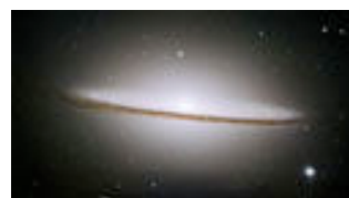
Sombrero Galaxy (M104)

image width 4.6 arcmin distance 86.4 Mly