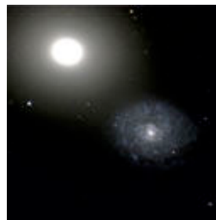
lenticular galaxy M60 (top left) and spiral galaxy NGC4647 (bottom right)

image width 4.6 arcmin distance 44.7 Mly