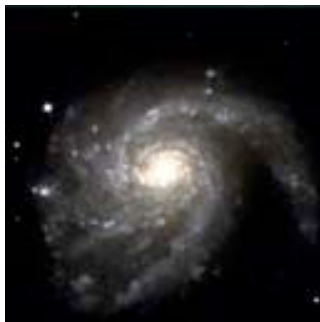
spiral galaxy M99

image width 4.6 arcmin distance 44.7 Mly