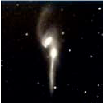
Two colliding galaxies The 'Mice'