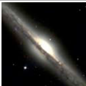
edge-on spiral galaxy NGC 4565

image width 4.6 arcmin distance 44.7 Mly