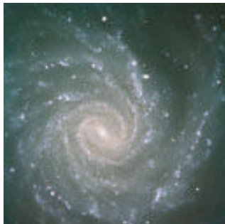
spiral galaxy NGC1232