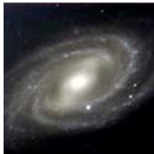
Spiral galaxy M109

HINT You do not have to fit the spiral arcs to the whole length of each spiral arms. Try fitting the arc to the part of the spiral arm where it fits best in order to measure the pitch angle. Then if you want to measure the total angle subtended by the spiral arm at the centre, you can re-fit it to the whole length, even though it does not then fit very well.