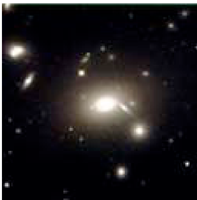
Part of the Coma Cluster of galaxies